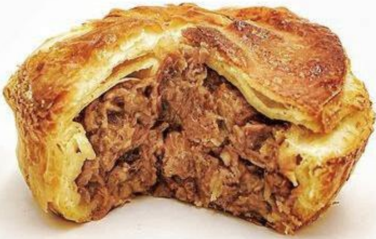
BBQ Pork Pie (Award-winner)