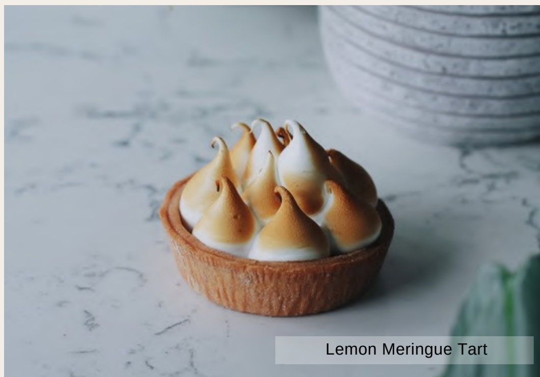
Lemon Meringue Tart