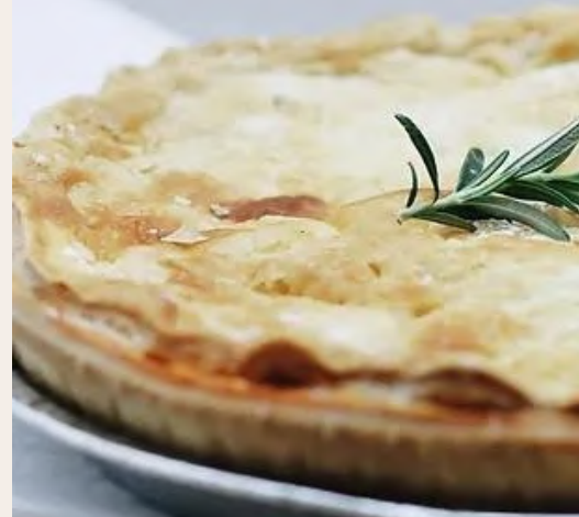
Family sized Savoury