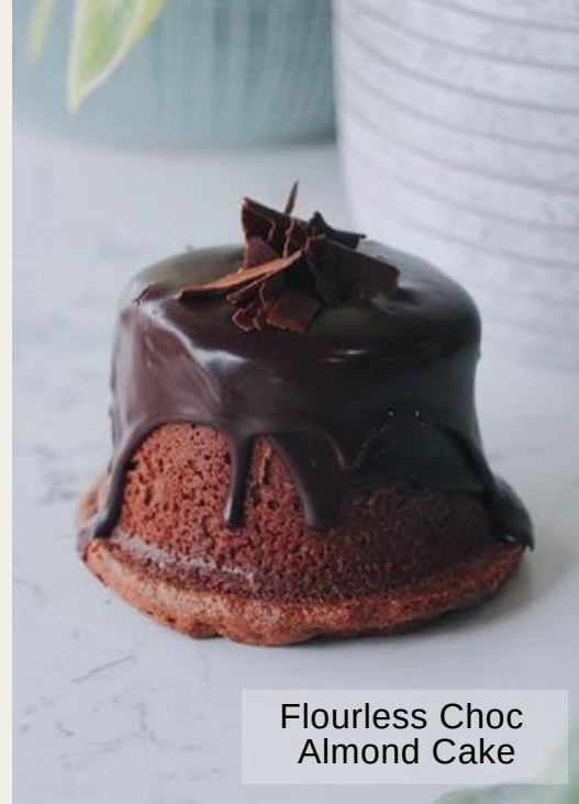
Flourless Choc Almond Cake