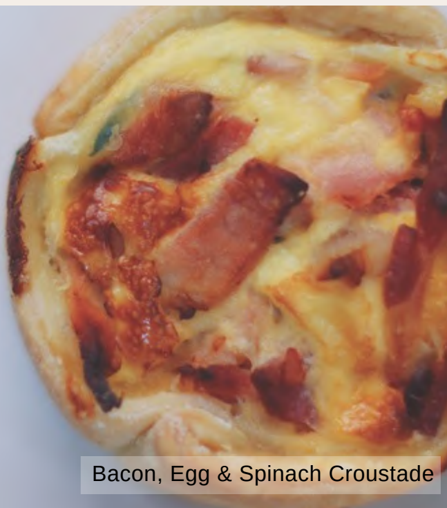
Bacon, Egg & Spinach Croustade