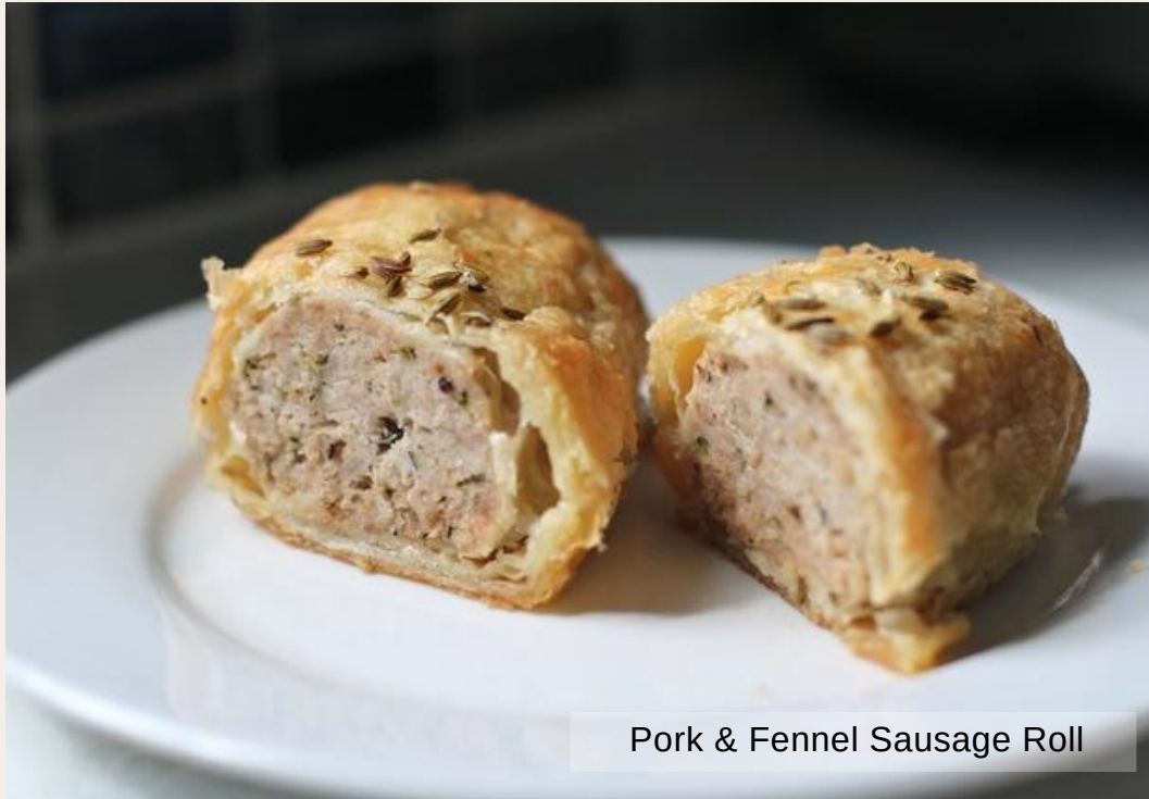
Pork & Fennel Sausage Roll