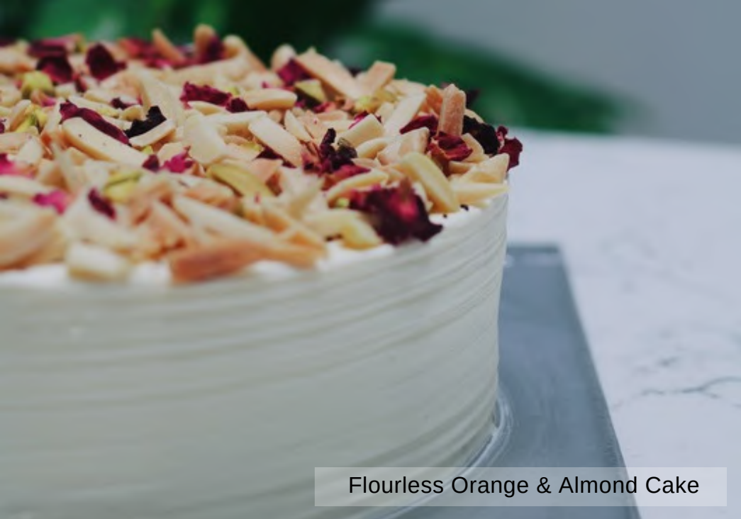
Flourless Orange & Almond Cake