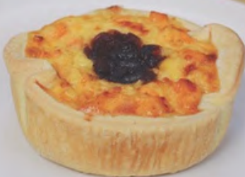
Sweet potato & Caramelised Onion Quiche